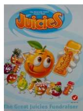
23. All Juicies $1.00 counter sale only