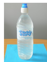
25. Mineral Water $1.80 counter sale only