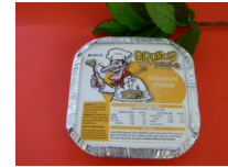
12. Macaroni $4.50 Cheese