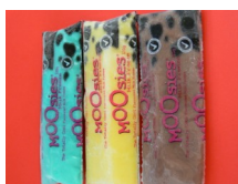
22. Moosie $1.80 counter sale only