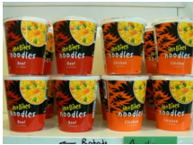
13. Noodles $3.00 Beef Chicken Spicy Shrimp