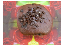
19. Chocolate $1.20 Muffin