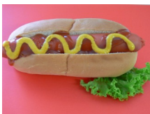
17. American Hot Dog $2.60 Sauce Mustard