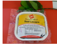
11. Beef $4.50 Lasagne