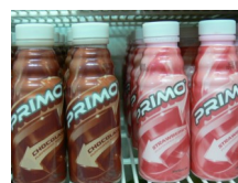
24. Primo Milk $1.80 counter sale only