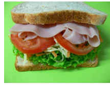
2. Salad Sandwich $3.50 Ham Chicken