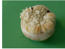
6. Potato Top $1.20 Savoury