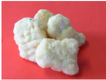
9. Chicken Nuggets $2.50