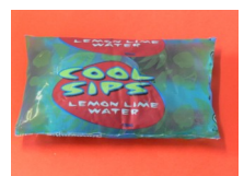
26. Cool Sip $1.30 counter sale only

Please circle the items you wish to order and place money in bag