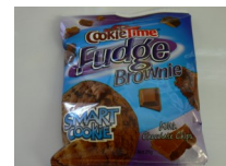
20. Fudge Brownie 90cents