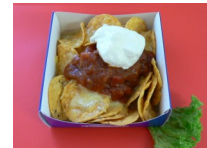
16. Nachos $3.80 Cheese Salsa Sour Cream