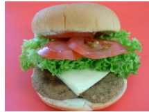
14. Chicken $4.00 Burger