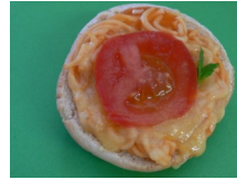
7. Spaghetti $1.50 Cheese Bun