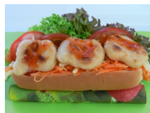
18. Chilli $3.80 Chicken Roll