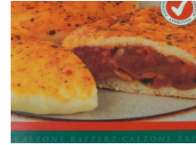
8. Calzone Pizza $3.00 Filling in a bread wrap