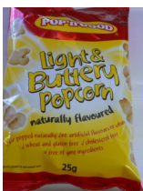
21. Pop Corn $1.30