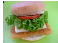
15. Fish $4.50 Burger