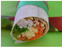
1. Salad Wrap $3.50 Ham Chicken

Amount enclosed: $ _____ Change required: $ _____