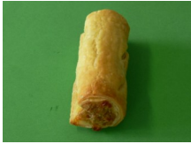
5. Sausage Roll $1.20